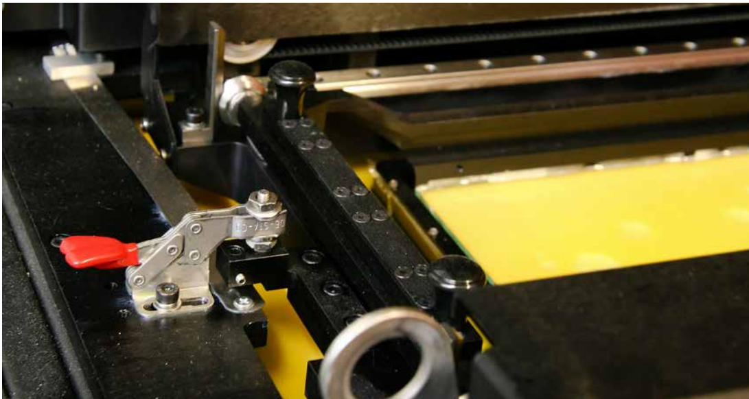
Model 206-HSS shown securing a platen on a prototyping machine.