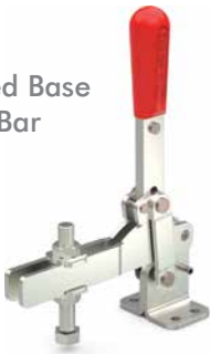
229 Flanged Base Open Bar