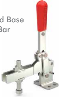
229 Flanged Base Open Bar