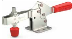
237-U Flanged Base U-Bar