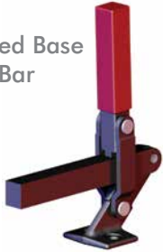
528 Flanged Base Solid Bar